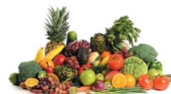
Fruit and vegetable