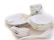
Chopsticks and tableware