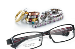
Glasses and Jewelry