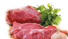
Meat and Seafood